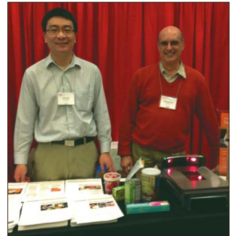
The DIGIMARC team demonstrating their invisible digital watermarking that achieved a new Guinness world record.

In addition to the Symposium plenary talks, many conferences held their own keynote presentations (see list on page 4). These provided an excellent opportunity to learn about the recent advances in a popular topic without being an expert in the field.