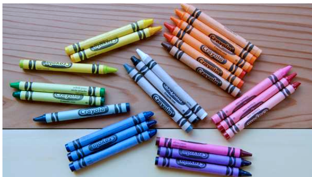
Figure 3. "If we try to sort colors, like these crayons, in a meaningful way, we need three types of descriptions. The first is whether they are colorful (those on the outside) or not (the white, black and gray in the middle), the second is by hue, or color name, such as red, orange, yellow, green, blue, and purple around the circle. And the third is by how light or dark the colors are. With those three types of describing words, we can accurately describe any colored object we can see."

As mentioned previously, approximately 200 student-submitted questions and short answers are included on a separate, but linked from each module, page called Short Answers . The final topic, Explorations , consists of a large number of books and website links for further research and learning at each level. This page is also linked through each of the modules along with the ever-present link to the feedback page.