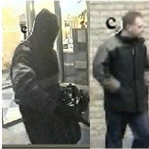
Fig. 4. Concordance between perpetrator and suspect with respect to: upper body neutral/slightly leaned forward, neutral/slightly forward rotated shoulders, and anteriorly positioned head, so the neck lordosis appeared prominent (c).