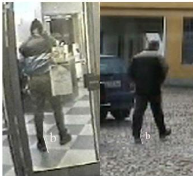
Fig. 3. Both perpetrator (left picture) and suspect showed inverted left ankle (b) during left leg's stance phase and markedly outward rotated feet.