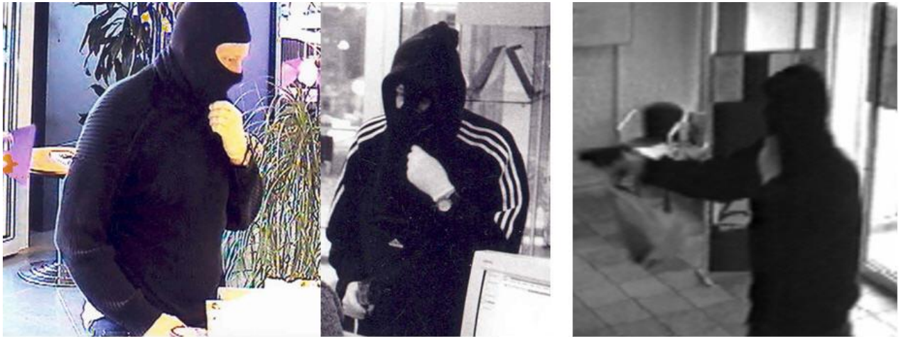
Fig. 5. Pictures might seem to be better evidence than they are. We had once compare the perpetrator from the two pictures to the left with a suspect who had confessed to one of the robberies. Based on poor material we could only conclude that the perpetrator and suspect were of the same height (photogrammetry) and that they had the same bodily proportions, especially a pronounced abdominal region and broad shoulders, – and that the two perpetrators hold their face mask in the same way as shown here. We did not find this very substantial, and stressed this, but the prosecutor in the case said afterwards that he was sure that these two pictures convinced the jury. Two month later we got a new case including the picture shown to the right which indicates that this way of holding the face mask might not have been as good evidence as the prosecutor thought it was.