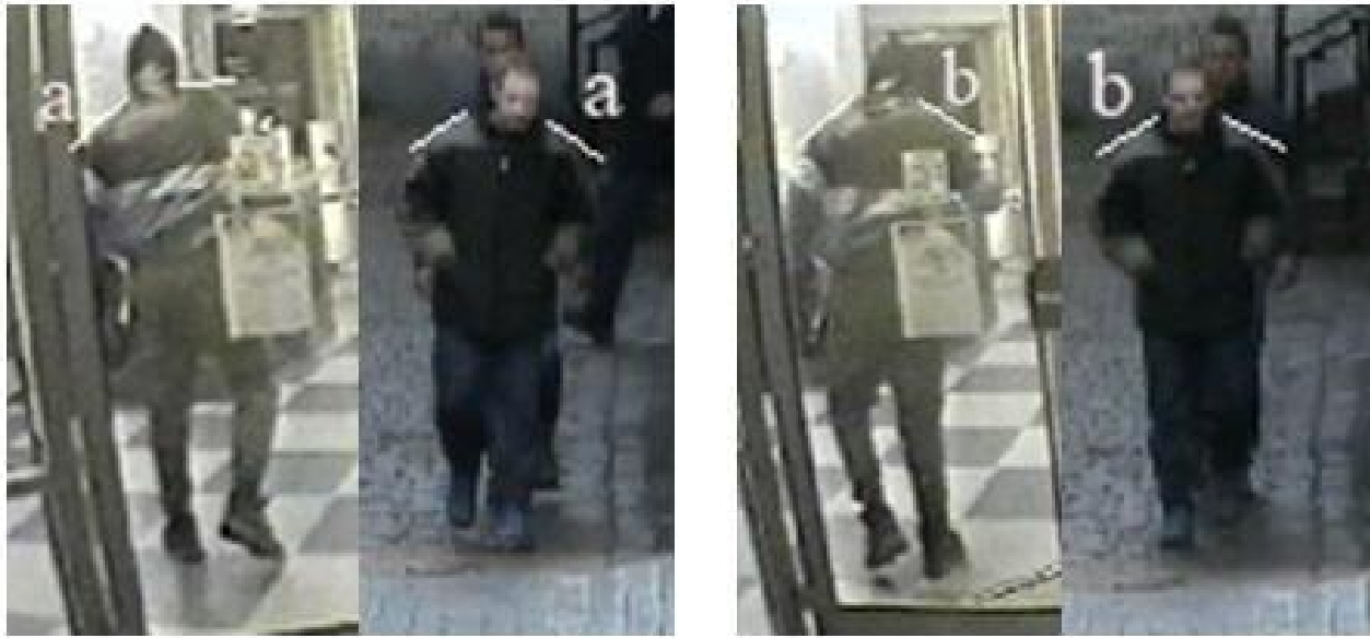
Fig. 2. Both the perpetrator (shown from behind) and suspect had greater lateral flexion of the spinal column to the left side (a) during left leg's stance phase than to the right side (b) during right leg's stance phase.